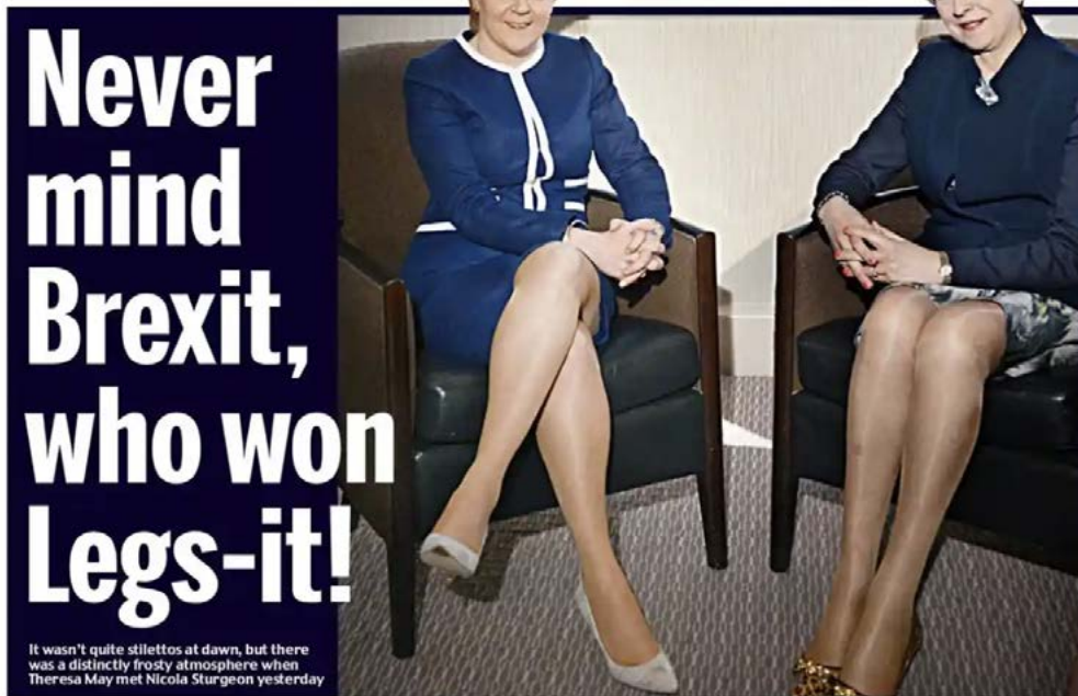
Fig. 1: A demeaning headline.

At other times, sexism comes across when women are simply erased. This happens in historical writing frequently: there is, perhaps, no phrase that erases more women than the simple but insidious 'and his wife'.