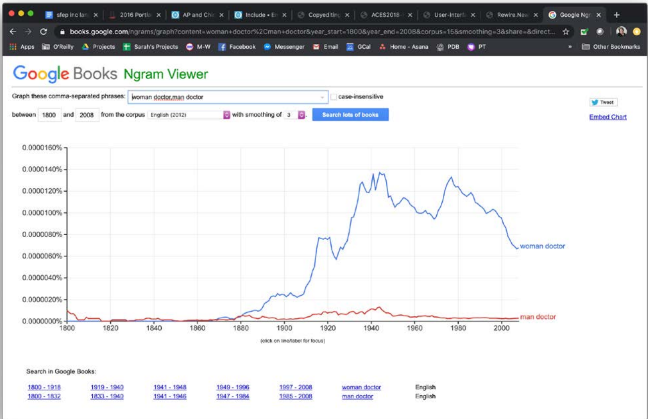
Fig. 2: Google Ngram comparison of 'woman doctor' and 'man doctor'